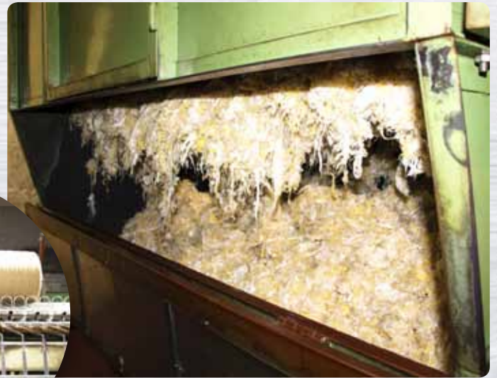
Machine for opening fibers

A light, white nonwoven is produced, which is spun into threads in the next production step.